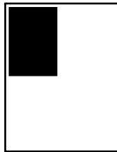
Quarter Page 1-2 photos/message 40 words or less