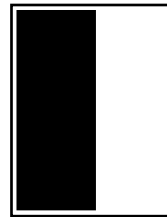
Half Page Vertical 2-3 photos/unlimited message